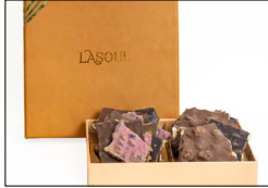
Belgian Chocolate with Nuts - 250grs

*All items can be personalized & packaged with a message of your choice