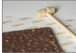
Belgian Chocolate with Nuts - 1 Sheet Box

شوكولاتة بلجيكي مع المكسرات Mixed sheets of Belgium Chocolate with Nuts (Ruby, Dark, Milk) 500AED