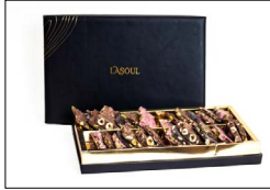
Belgian Chocolate with Nuts - 550grs

شوكولاتة بلجيكي مع المكسرات Mixed sheets of Belgium Chocolate with Nuts (Ruby, Dark, Milk) 330AED