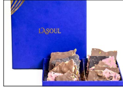
Belgian Chocolate with Nuts - 350grs

شوكولاتة بلجيكي مع المكسرات Mixed sheets of Belgium Chocolate with Nuts (Ruby, Dark, Milk) 230AED