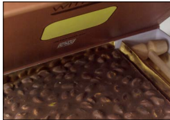
Belgian Chocolate with Nuts - 2 Sheets Box

شوكولاتة بلجيكي مع المكسرات Sheet of Belgium Chocolate with Nuts 170AED